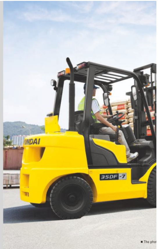
■ The photo

HYUNDAI DIESEL FORKLIFT TRUCKS Environmentally - Friendly